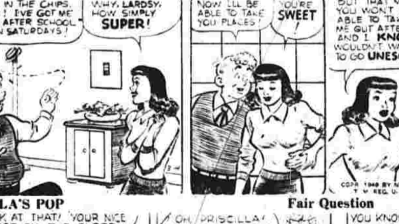
BY MERRILL C. BLOSSER